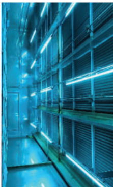
Air Handler Disinfection

For more information on Fresh-Aire UV systems or to discuss your specific application, please contact 1-800-741-1195 or email sales@FreshAirUV.com .