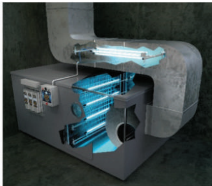
Air Handler & Airstream Disinfection